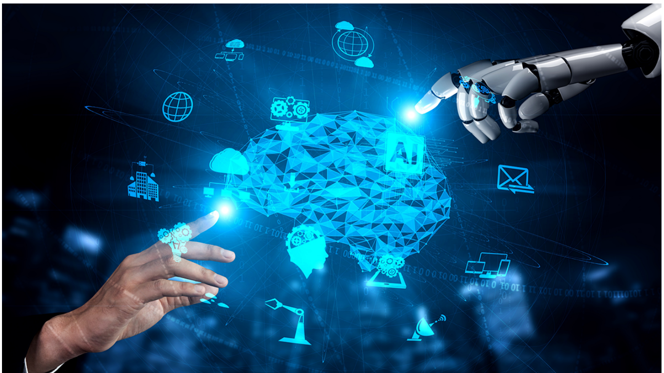
Navigating challenges in AI inclusion